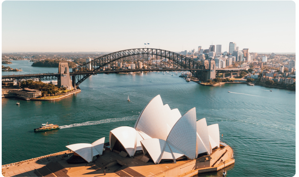
<Landmarks of Sydney, Sydney Opera House & Harbour Bridge>

For international students, Sydney is a great place to study. With its world-class education system, Sydney is an ideal place to pursue higher education.