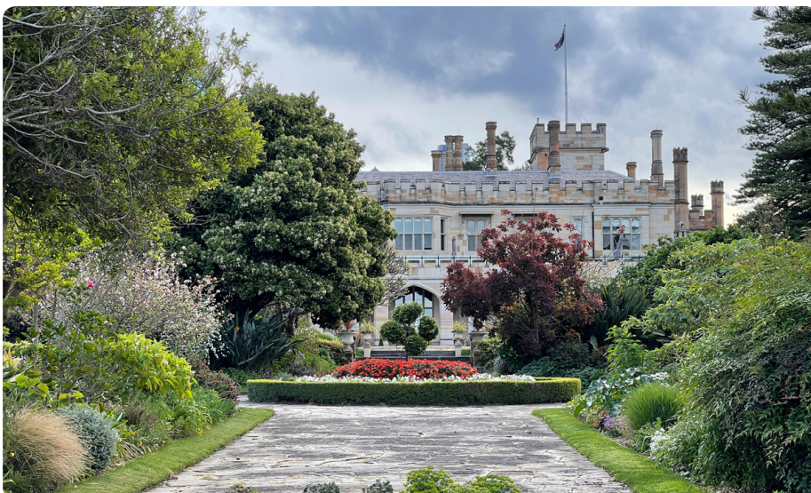
<Nature in the Urban, Royal Botanic Garden>

For those who want to explore further, Australia is the perfect place. From the Great Barrier Reef to the Outback, Australia is home to some of the world's most stunning landscapes. Whether you're looking for a relaxing beach holiday, inspiring scenery or an adventure in the wilderness, Australia has something for everyone. With its diverse population, Australia is home to a variety of cultures, from Indigenous Australians to immigrants from all over the world. This makes it a great place to learn about different cultures and make new friends. Overall, Australia is an incredible place to study and explore.