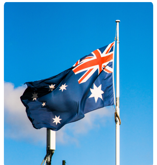
<The Flag of Australia>