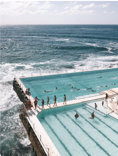
<Beautiful Blue, Bondi Beach Rockpool>

Sydney is also a great place to explore. Known for its café and restaurant culture, Sydney offers students an exciting social life. From its iconic landmarks, like the Sydney Opera House and the Harbour Bridge, to its many parks, waterways and beaches, there is something for everyone in Sydney. Nearby national parks and world-famous Blue Mountains offer pristine nature experiences for everyone.